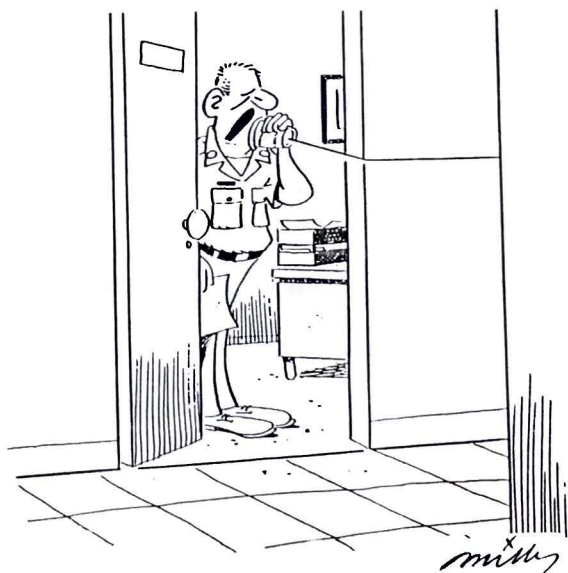
"Are you sure this line is secure, Smith?"

A good impression reflects a good working environment and pride in your unit. A sharp looking work force sets the tone for a proper attitude and connotes a professional approach to meeting the mission.